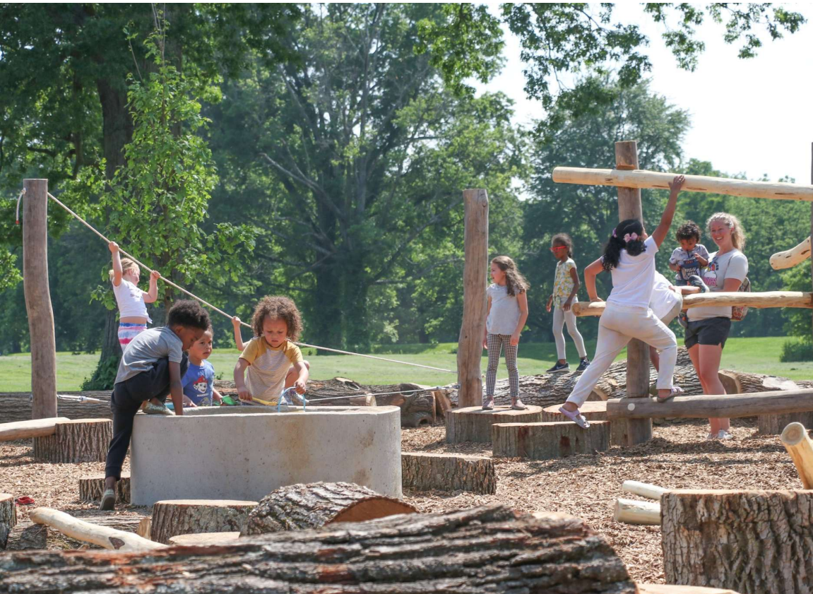
Shawnee Park in Louisville, Kentucky