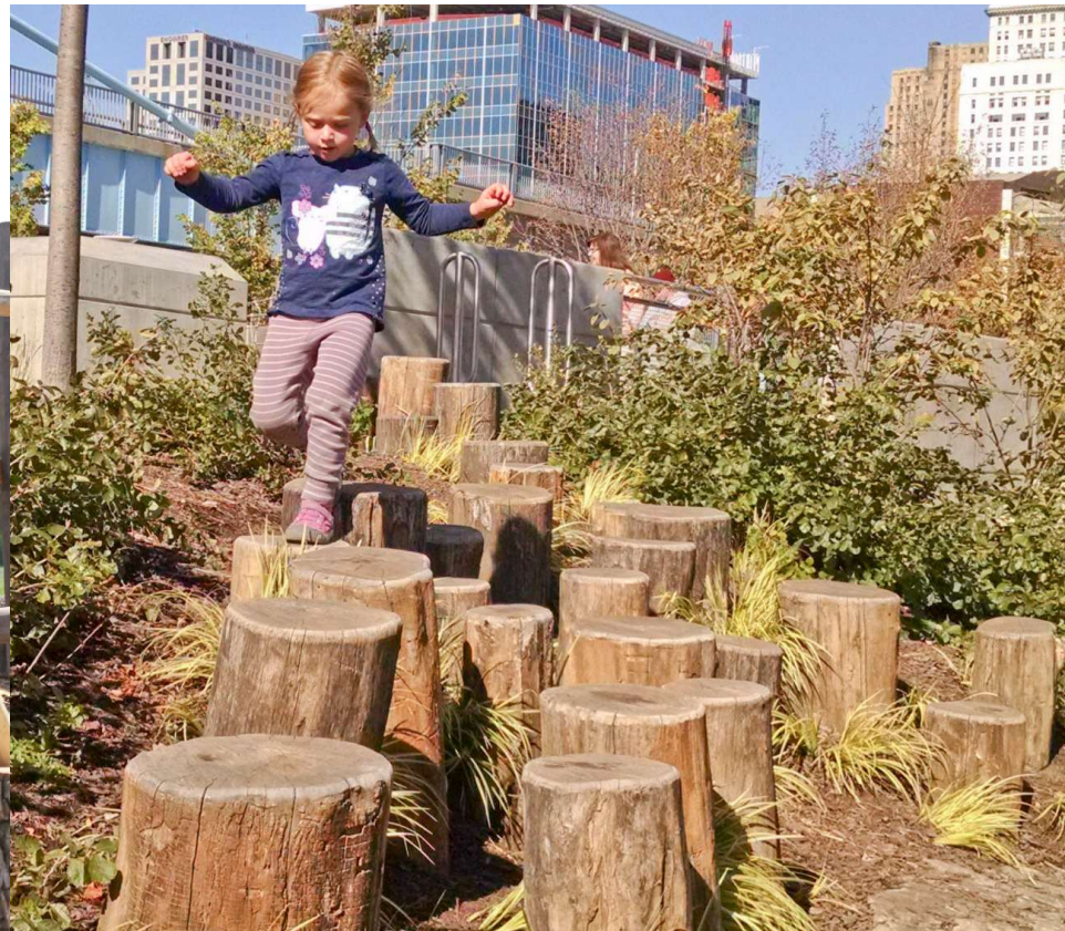
Smale Riverfront Park in Cincinnati, Ohio