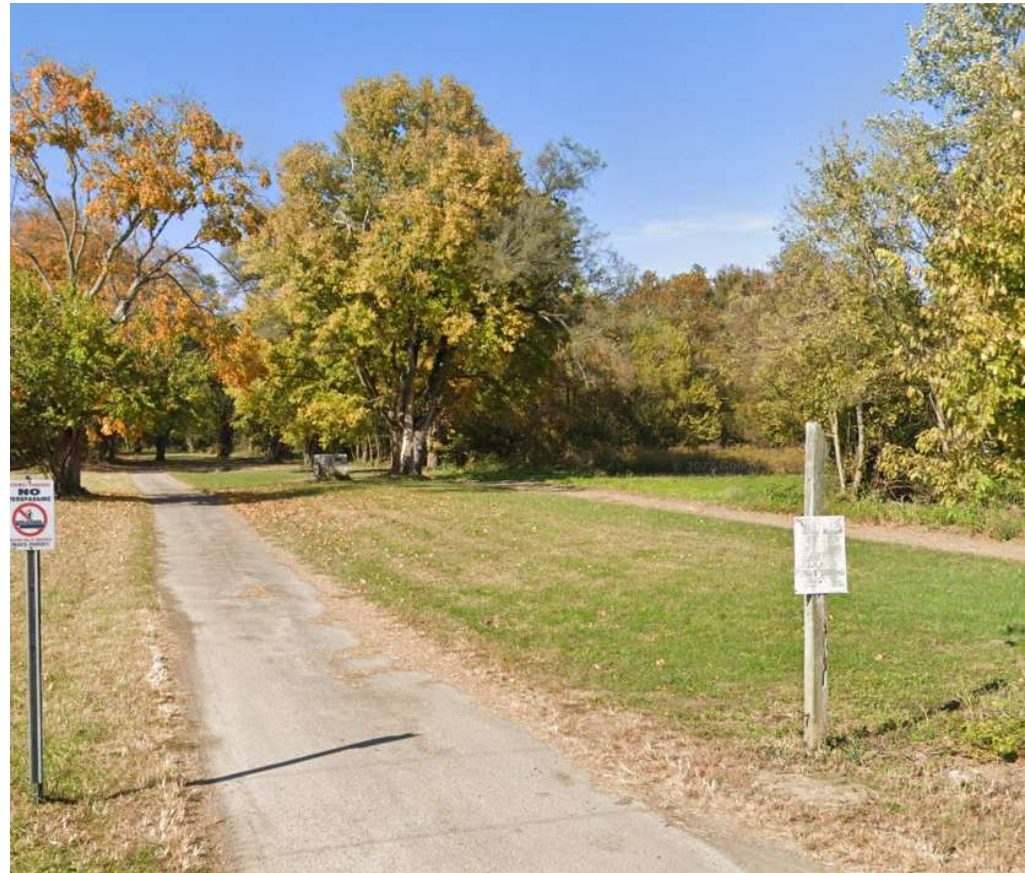
Washington Blvd. - Google Earth October 2022