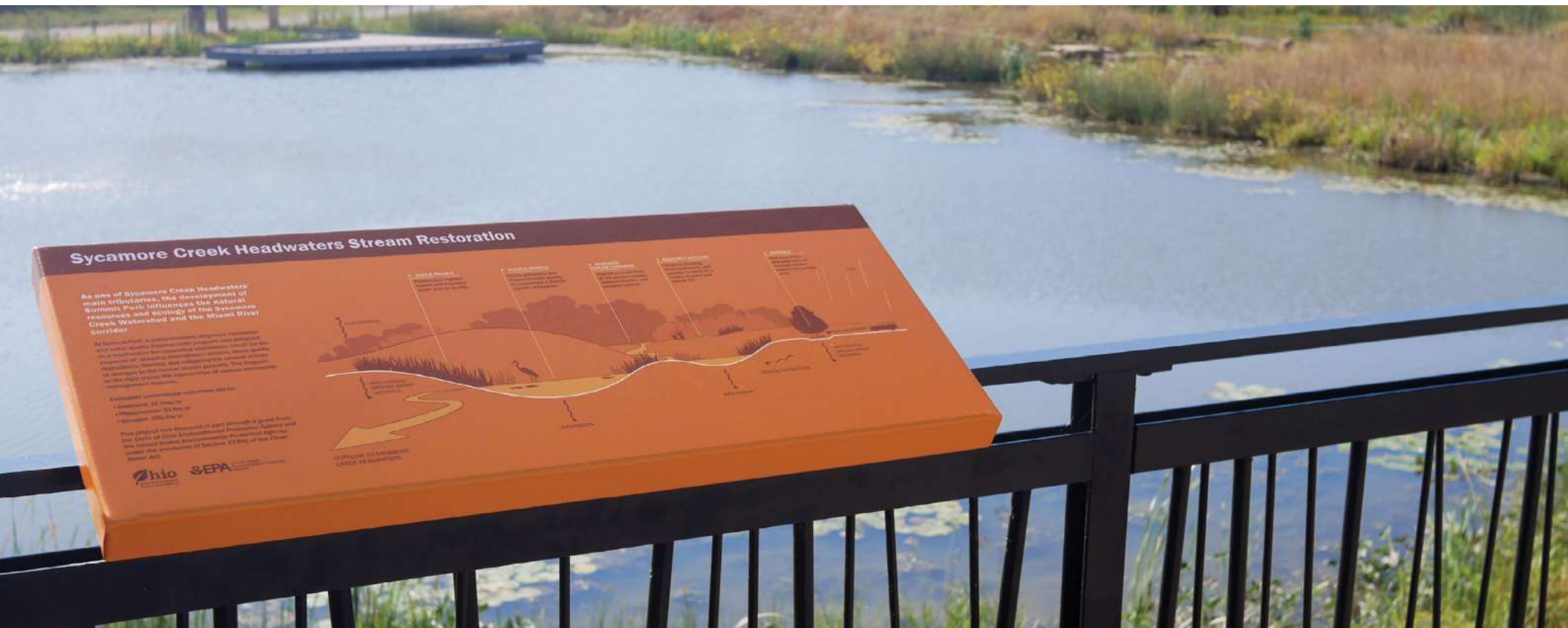
Summit Park Interpretive Signage Blue Ash, Ohio