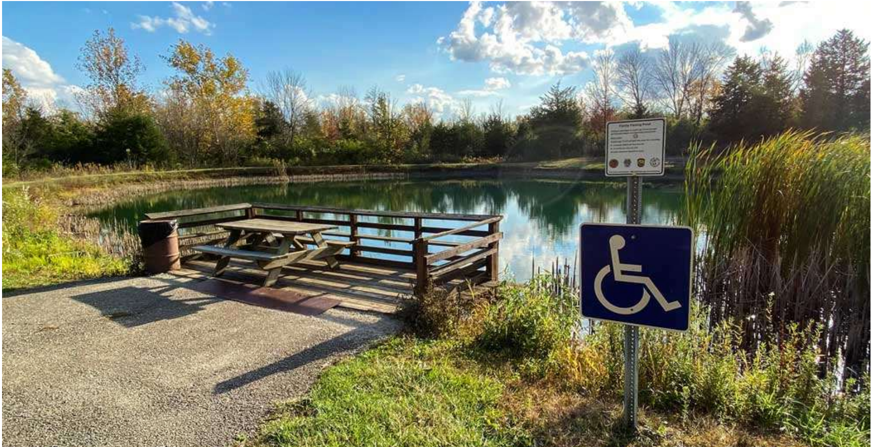
ODNR Accessible Fishing Access